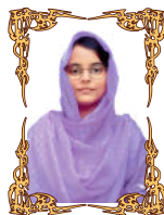
Content Writer: Sana Azeem